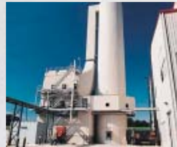
Scrubber and electrostatic precipitator for E-Glass

NOx generation is minimized at the design stage by paying attention to details of the combustion system, the insulation level and the hot-sealing of the furnace.