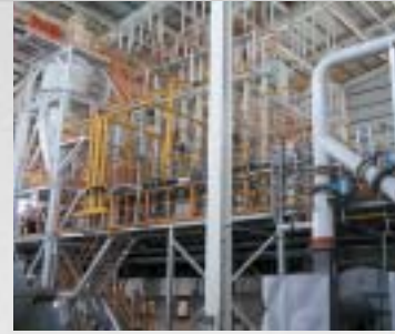
Recuperative furnace melting E-Glass, performing at 65 metric tonnes/day (72 US tons/day)

TECO pioneered the use of recuperators in conjunction with E-Glass melting. The use of special steels and refinements to the design allows the recuperators to be successfully used on furnaces to melt E-Glass, allowing higher melting rates and more efficient energy consumption. Apart from the recuperator itself, the whole combustion system is designed to suit the melting of E-Glass, with special hot-air burners for either oil or natural gas and furnace pressure control as an intrinsic part of the system.