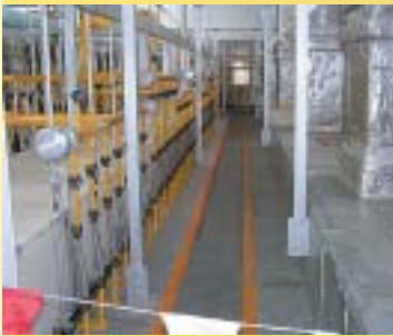
E-Glass forehearth application

TECO offers gas-fired distribution channels and bushing forehearth for E-Glass melting units in a variety of configurations, feeding up to 100 or more fiberizing bushing positions. The TECO forehearth system delivers molten glass to the bushings at the correct temperature with minimum variation throughout the forehearth system, thus helping to maximize production efficiency. Even at forehearth temperatures, the relatively high boron content of E-Glass is subject to significant volatilization which, as a condensate, is very aggressive towards the distributor channel and bushing forehearth superstructure refractories. TECO's many years of experience in superstructure design and refractory selection ensure that condensate is kept outside the flow-channel areas so glass quality is maintained and service life is maximized. In certain circumstances, it is desirable to provide bottom drains and other features to prevent stagnation of glass at low flow rates.