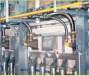
Oxy-fuel E-Glass furnace operation

Oxy-fuel furnaces are a natural way of avoiding pollution because they virtually eliminate nitrogen from the combustion process.